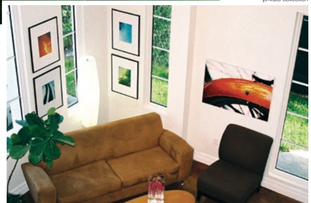
Flagler on Fifth townhome private collection